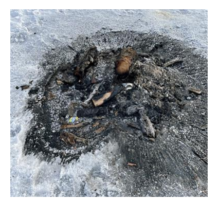
Fire ash also adds to the nutrient loading of the lake.

The WWMC have been hearing reports of excessive amounts of dog feces being left on the lake this winter. In addition to feces, people have been leaving other garbage including drink containers, fireworks debris and the remains of fires on the ice.