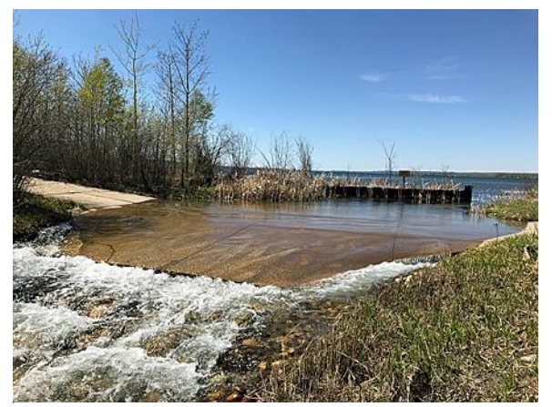
Outflow over The Weir, starting Wabamun Creek

The only outflow from the lake is a small stream at the east end which is governed by "The Weir" a simple depression