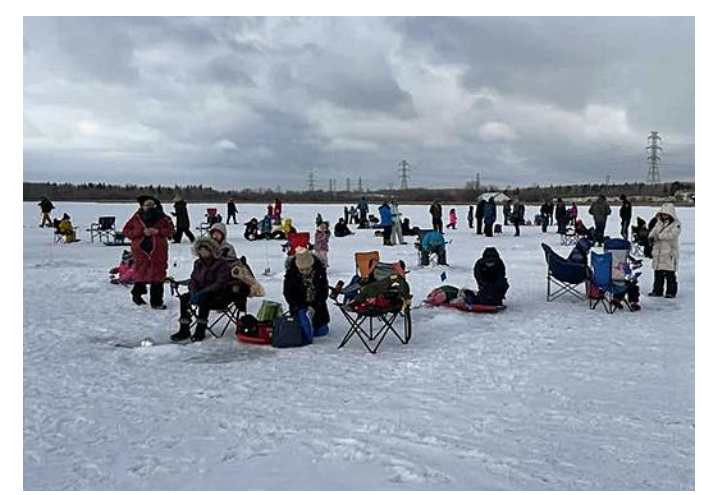
Alberta Conservation Association's Kids Can Catch, Wabamun Lake, Family Day 2023